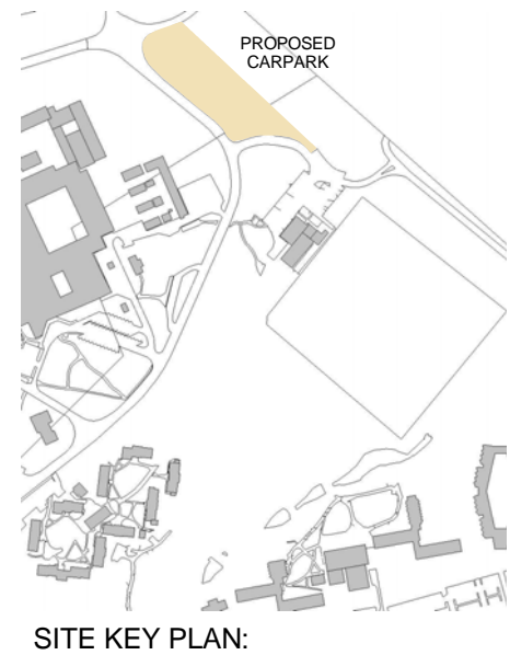
SITE KEY PLAN: